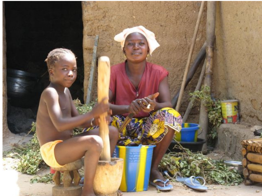
Busy: The whole family has a job to do. In Bandiagara, the "gate-way" town to Dogon Country, this girl is pounding millet into flour with a giant mortar and pestle. Her mother is also preparing food.