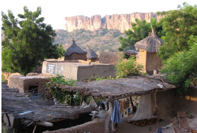
Star Gazing: I spent my first night in Dogon Country in the chief's compound in the village of Nombori. The photo is taken from the roof where I slept, gazing at the stars and the sharp silhouette of the escarpment on the horizon. Another mattress and mosquito net are in the bottom right-hand corner of the picture, the typical sleeping arrangement for this part of the trip.