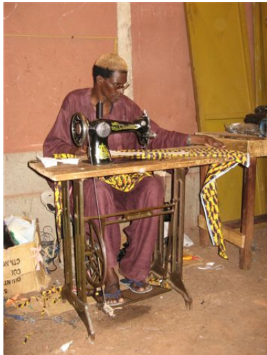
Eye for Detail A tailor in Bobo-Dioulasso's central market lovingly prepares a bright new African shirt for my husband back home.

A price needed to be negotiated. I knew how the routine worked. They would quote me a figure. I would fake outrage and quote something about one quarter of that. "Ah, Madame, please," they would exclaim. "My family needs to be fed. And look at the quality of this material. You must offer me real price." And the debate would continue until middle ground was reached.